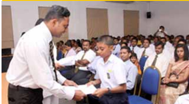
A donor hand over an award to a student

The (HNS) Scholarship Programme established in 2003 continues to facilitate students with financial need. In 2010/11 a total of 135 scholarships (125 student and 10 undergraduate) have been awarded.